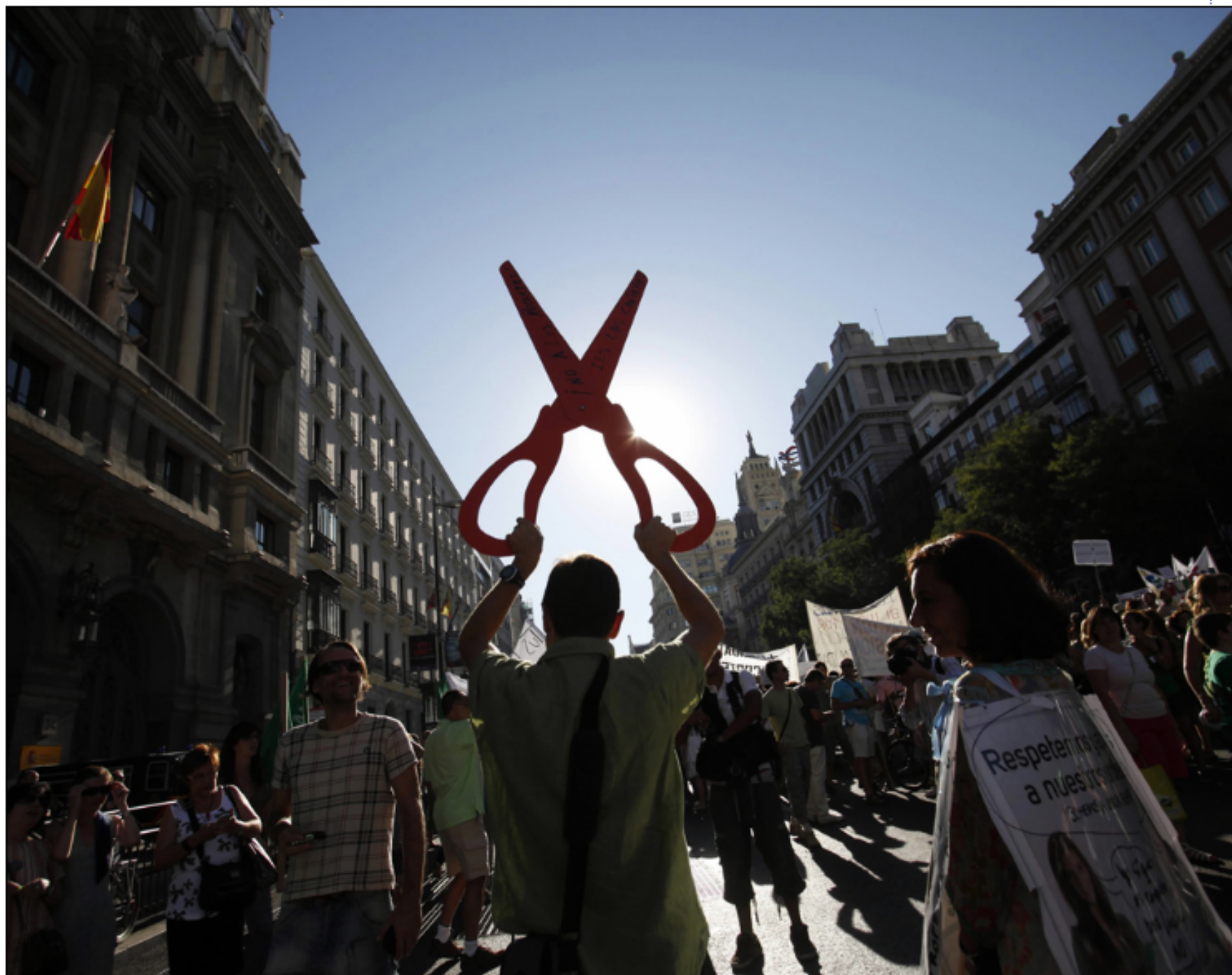
29 Teachers take part in a demonstration against proposed budget cuts in public education in central Madrid September 7, 2011. #